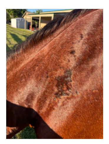
3/15/23 8 days on EPICOAT – noticeable difference and less irritated