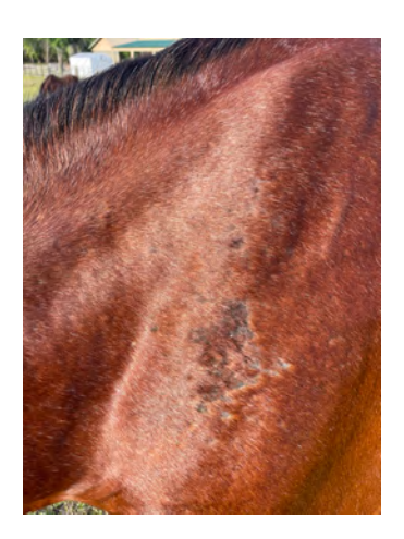
3/17/23 10 days on EPICOAT – only 2 days later and still improving