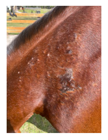
3/7/23 First day on EPICOAT – super itchy with scabs and open sores

"After trying just about every combination of supplements, creams, and shampoos on the market, nothing seemed to work for him until trying EPICOAT!! " — Paige Smith