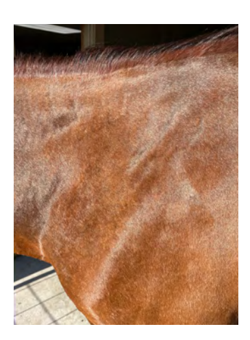
5/2/23 Almost 2 months on EPICOAT – no itching or irritation, coat is soft and shiny!